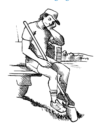
Getting too little sleep can distract you from your job.