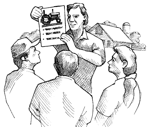
Be sure to attend all of our safety meetings.