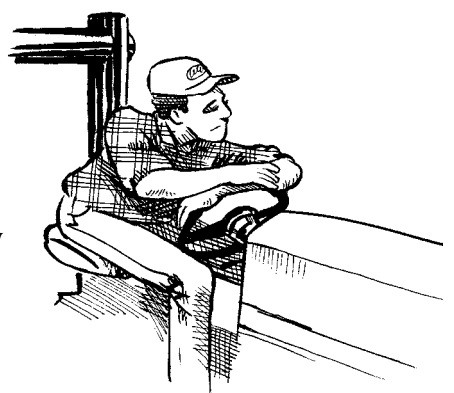
Accidents can result from falling asleep on the job.