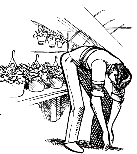
Taking a few minutes to stretch can help reduce fatigue.