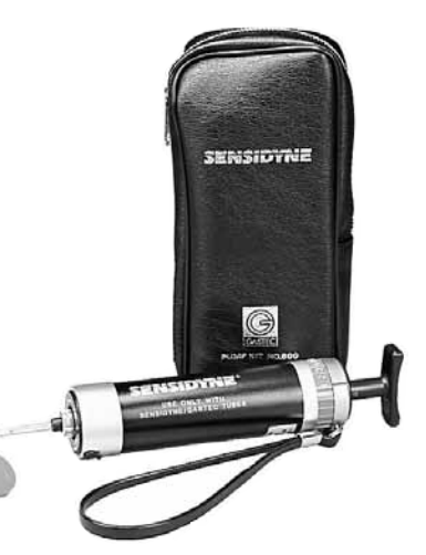
A gas detection monitor is needed to detect the level of carbon monoxide in a building.