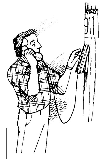
Call for emergency medical help immediately if someone at home or work is overcome by carbon monoxide.

Note to trainer: Take time to answer trainees' questions. Then review the Carbon Monoxide Do's and Don'ts.