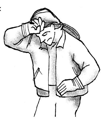
(Continued on back)

See our <u>full line of safety supplies</u>, including respirators, eye and ear protection, coveralls, first aid and more.