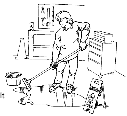
Some hazards, such as wet and slippery flooring, can often be eliminated right away.