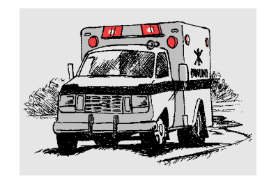
Sometimes injuries aren't reported because the person is concerned about the cost of treatment or taking time off work.