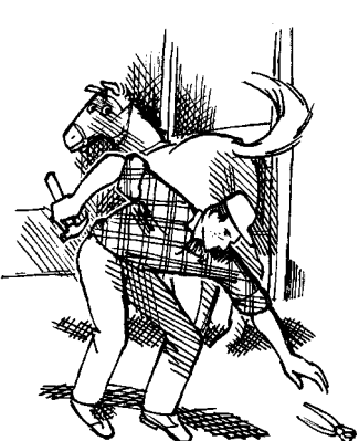
Near misses often occur when people aren't keeping a close lookout for potential hazards.