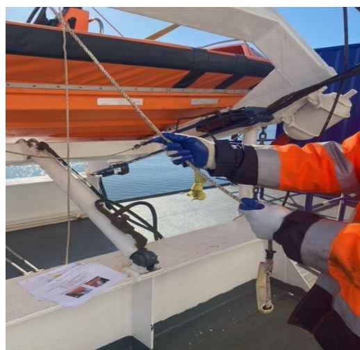
Emergency Lower Line