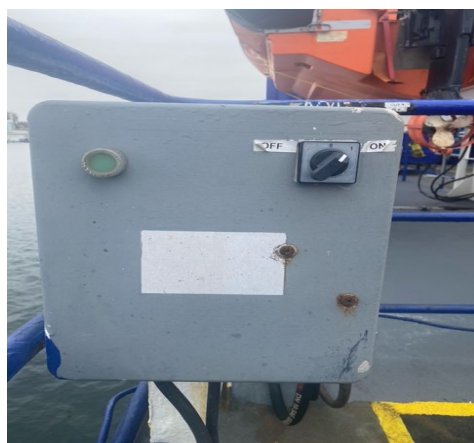
HPU in ON